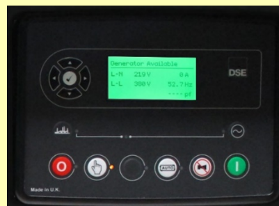
MANUAL & AUTO - START GENERATOR CONTROLLER (DSE 6110MKIII)